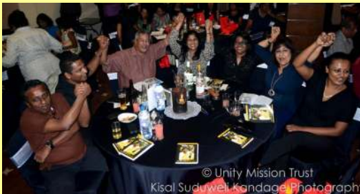
Audience singing along