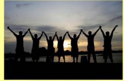
Unity Team members in Jaffna

Would you like to know more about the work of UMT? Are you interested in joining as a volunteer to help with future UMT activities? Contact us for more details!