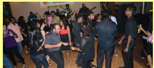
Committee hits the dancefloor!

The UMT Team is proud of & congratulates our 4 achievers!