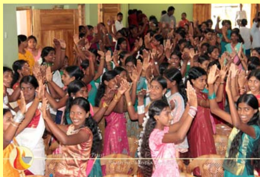
Tuning in at the commencement of the Zoom In programme