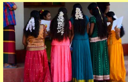
Vibrant colours at registrations