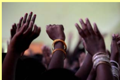
250 youth—dancing in unison