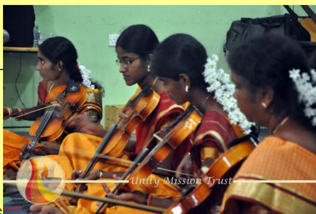
Our very own UMT Orchestra in action!