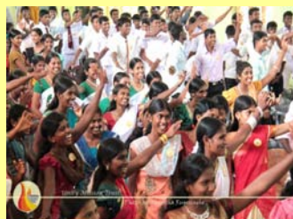
Relaxing the fun way!

This avurudu season, the Unity Mission Trust team visited the North bearing gifts of love for 500 outstanding youth from Kilinochchi and Mullaitivu. Two very special Zoom-In programs were held, one at the Mulliyaweli Vidyananda College and the other at the Kilinochchi Maha Vidyalayam. They were leadership refresher & reunion programs for a group of hand-picked youth, who in their own respective areas were considered outstanding. UMT hosted 250 youth at each program, which focused on self - development and leadership, through interact lectures, mind development games and activities. The youth in both places were also introduced to the ways in which the Sinhala and