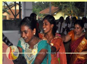
Team building in action