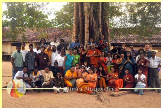
Team UMT—at the end of Zoom In 3 Mullaitivu