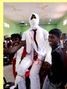
Team building & Leadership activity A key moment!