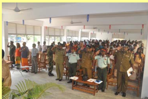
A salute to Mother Lanka