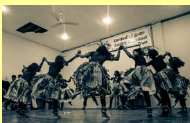
Special "Aadivaasi" dance—Mullaitivu